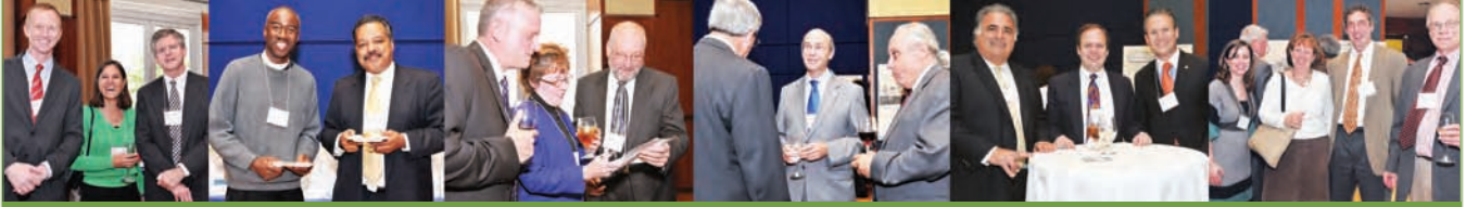
Over 80 city officials, tourism executives and representatives from the 20 Classic Towns were in attendance. The event began with a cocktail reception, and was followed by a program and plaque presentations.