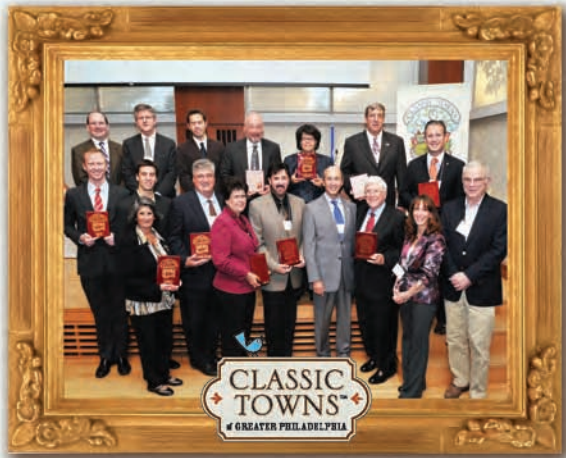
Representatives from the 2009 Classic Towns.

In October 2009, nine towns were welcomed into DVRPC’s “Classic Towns of Greater Philadelphia” program. This marketing initiative is aimed at growing, revitalizing, and supporting the region’s older suburbs and urban neighborhoods. It promotes Classic Towns as great places to live, work, and play.