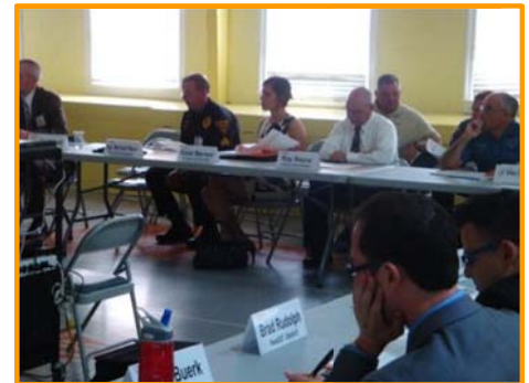
RSTF members engage in a discussion to develop strategies to reduce impaired and distracted driving