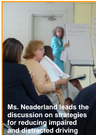
Ms. Neaderland leads the discussion on strategies for reducing impaired and distracted driving