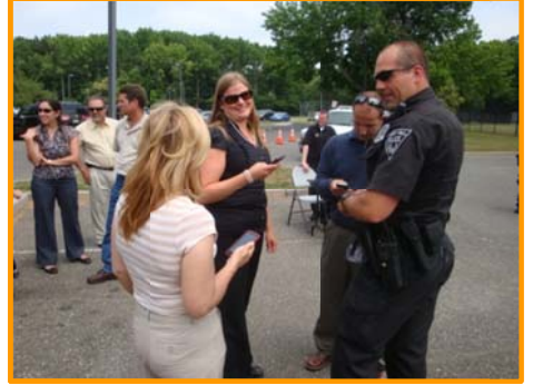
There is interest to try the course driving while distracted (texting)