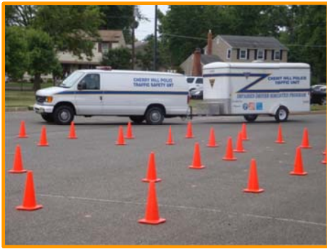
Cherry Hill Township Impaired Driver Simulation Course