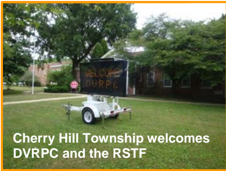
Cherry Hill Township welcomes DVRPC and the RSTF