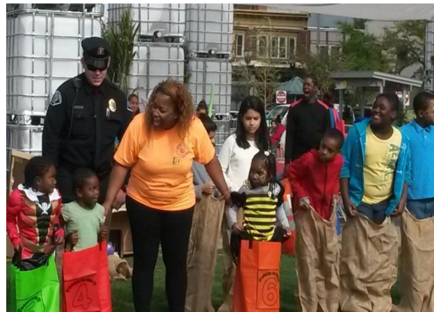
Participating In Community Events