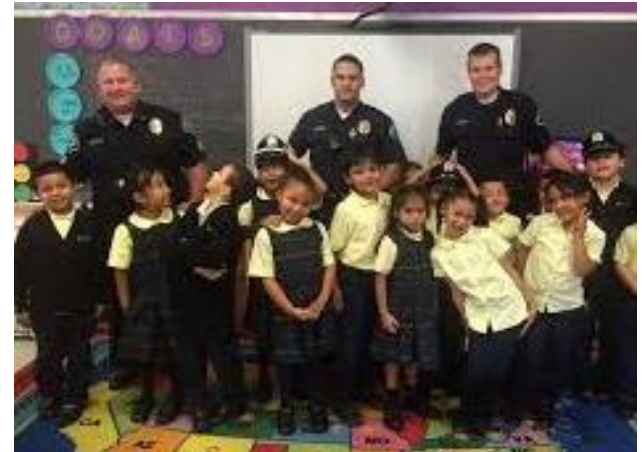
Engaging Children From An Early Age