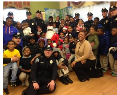
Christmas Party & Toy Giveaway