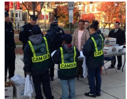
Blue Knight Community Safety Event