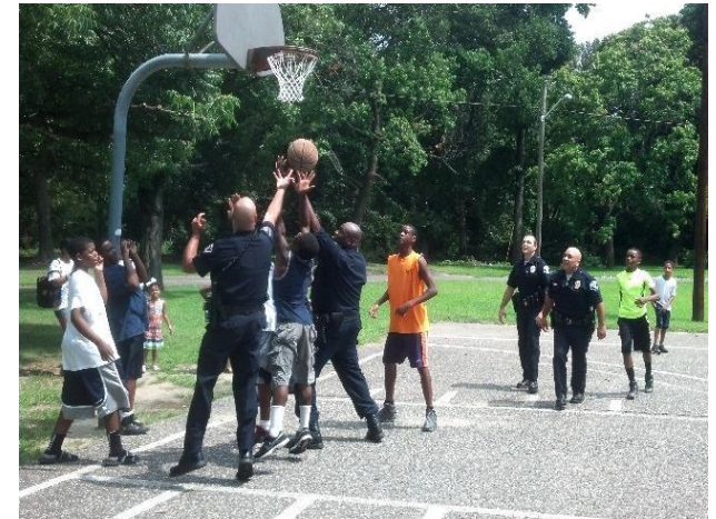
Interacting With At Risk Youth