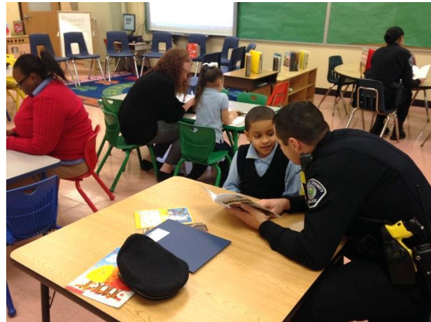
Encouraging Reading & Promoting Education