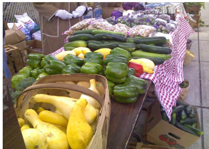
Farmers Market 11/09