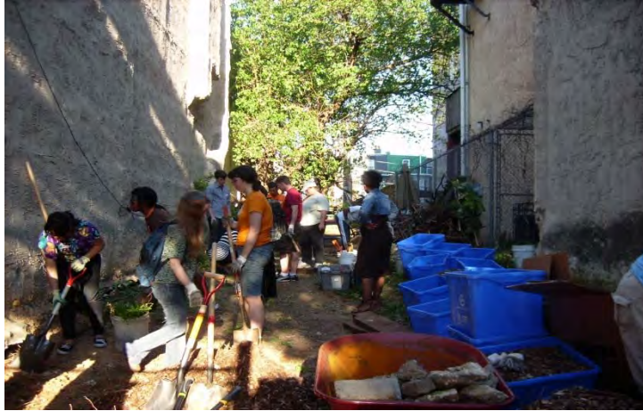
PHS Garden Build Volunteers 5/10