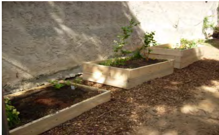
3 Raised Beds Planted 5/10