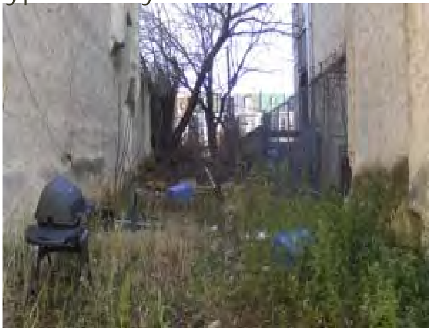
Typical City Vacant Lot