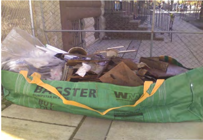
Philly Spring Clean Up 4/10