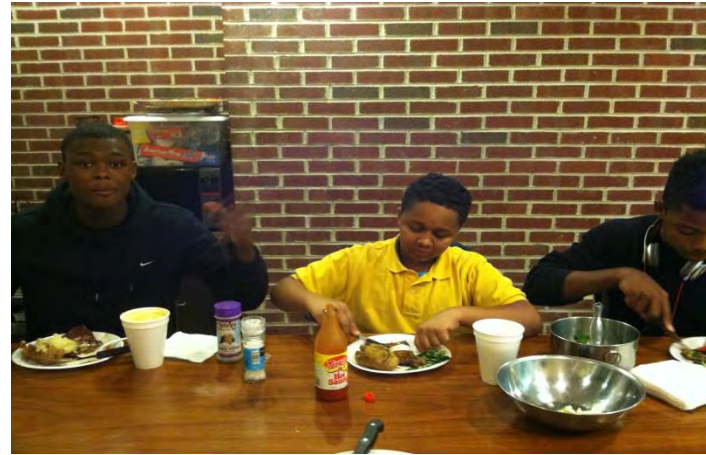
Healthy Food – Nutrition