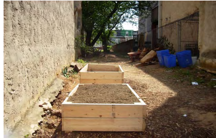
3 Raised Beds Completed 5/10