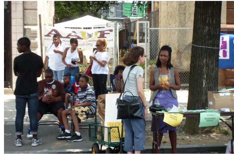
Harambee Event 6/10