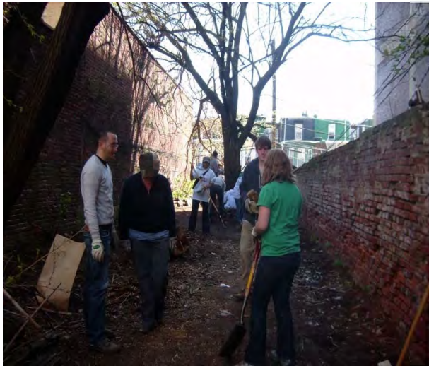
Clean Up Volunteers 4/10