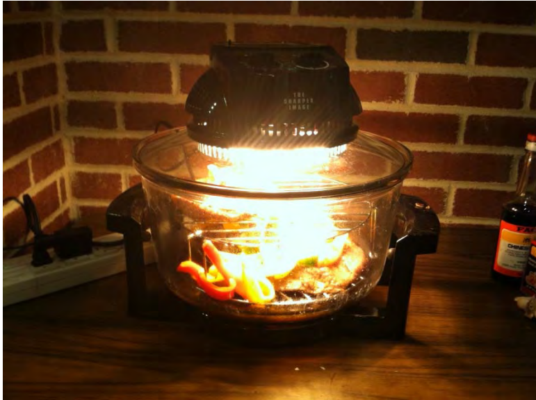
Cooking Class - Training